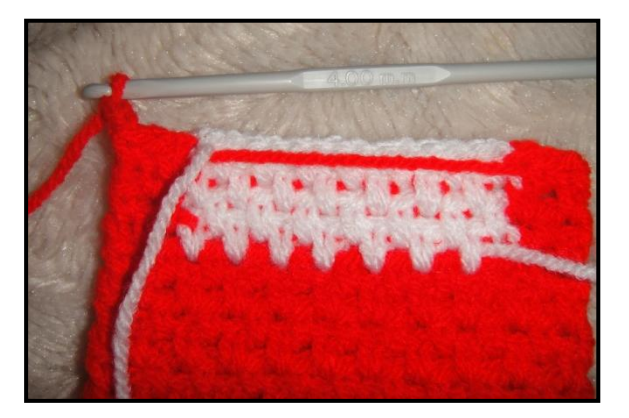
Yarn: to the back of the work in top row and crocheted over in other rows