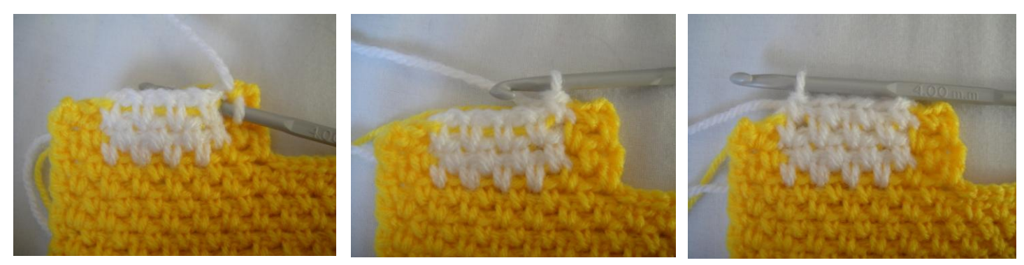
Insert hook under the coloured yarn in ch-1 sp

If you are going to crochet over the yarn, make sure that you put your hook in under the coloured yarn when you work into the ch-1 space. This will pull the colour up under the next row, making it less visible.